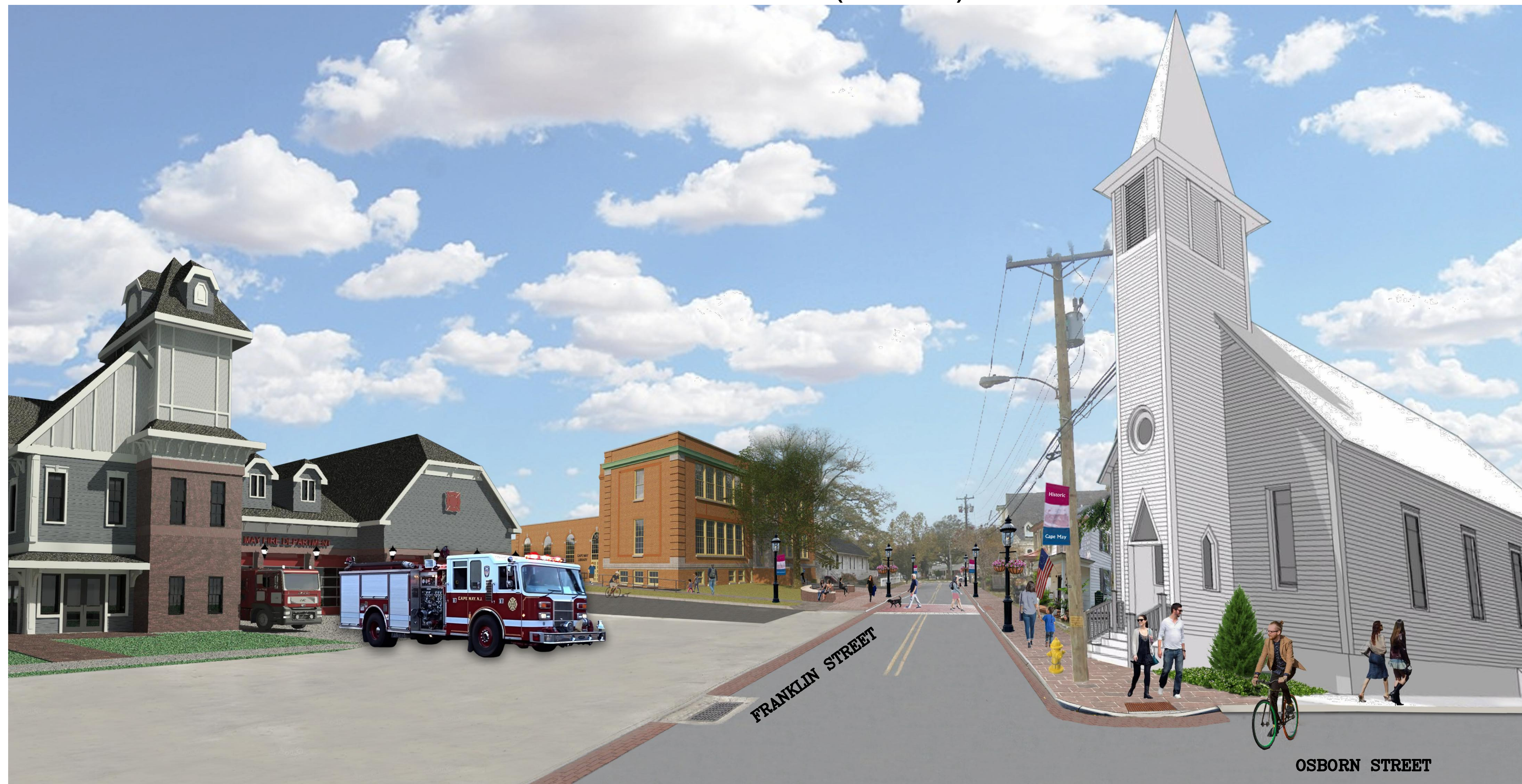
FRANKLIN STREET CONCEPTUAL PERSPECTIVE