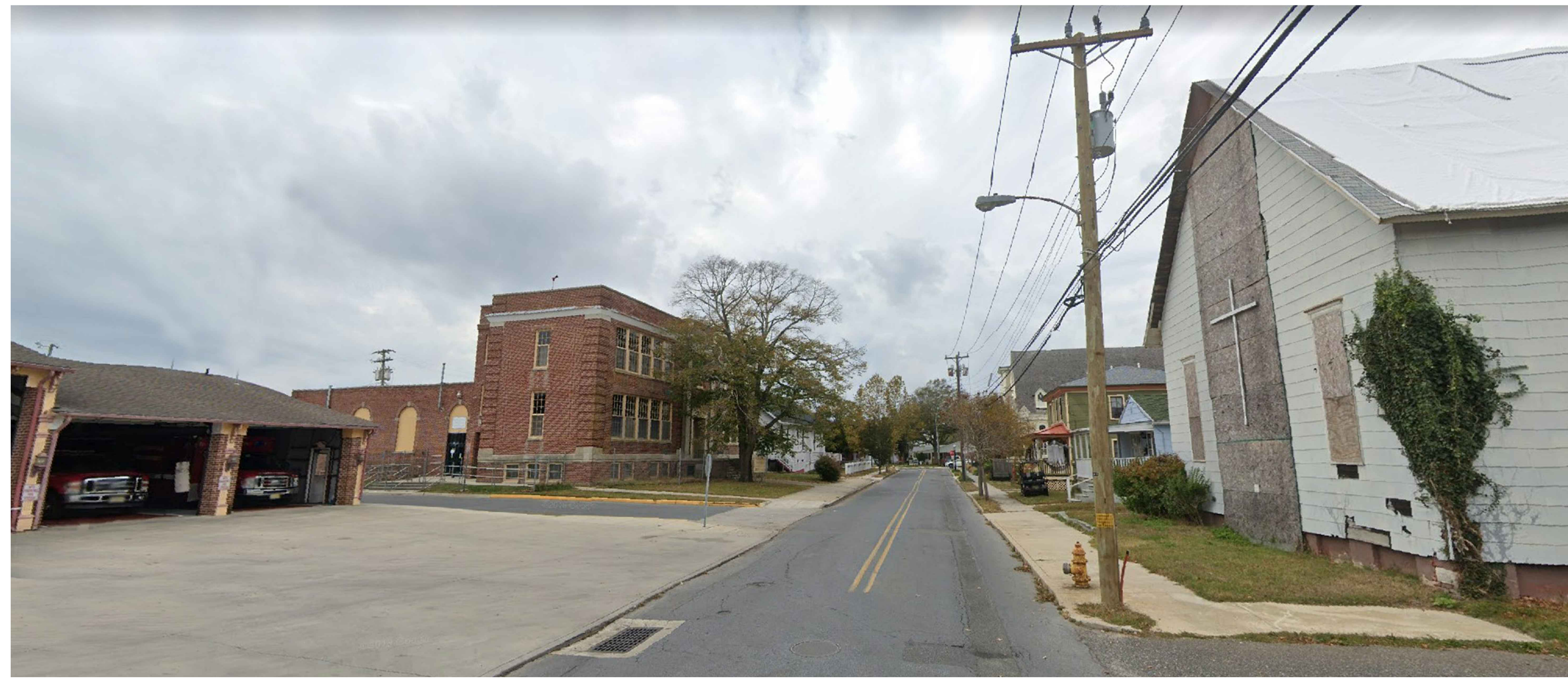
EXISTING FRANKLIN STREET VIEW (WEST)