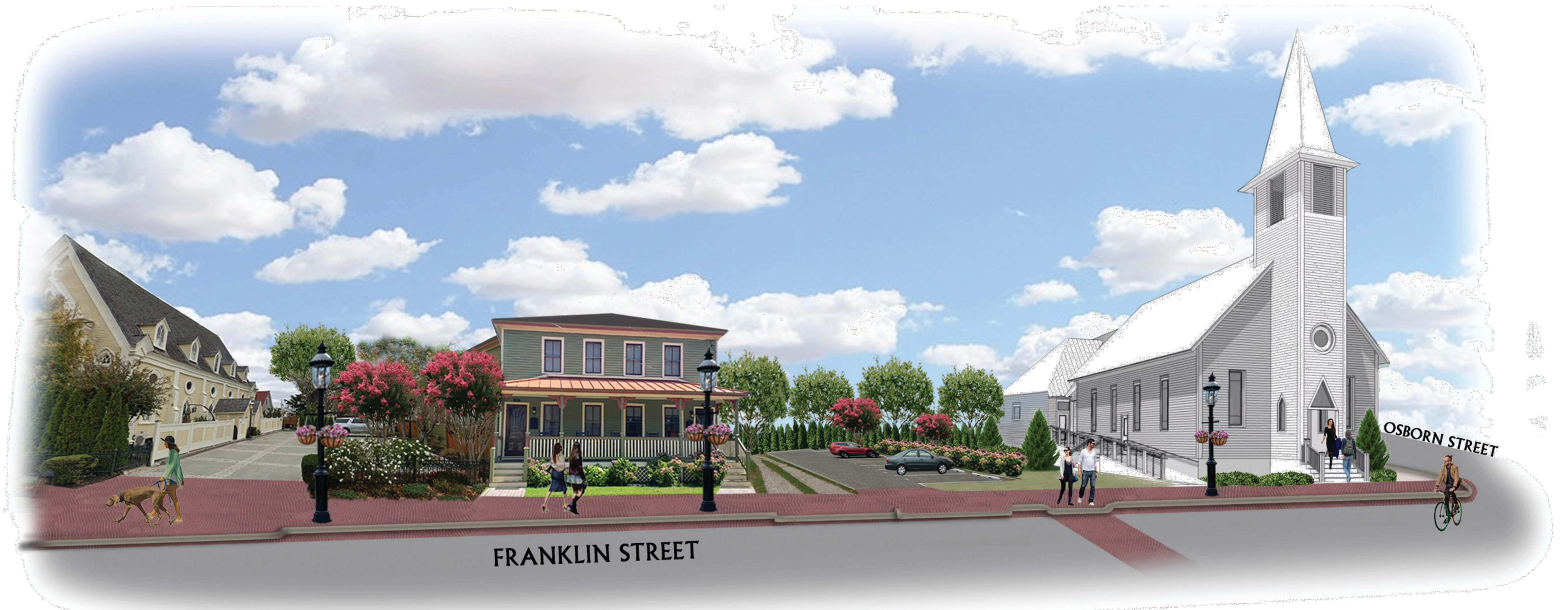
FRANKLIN STREET CONCEPTUAL PERSPECTIVE