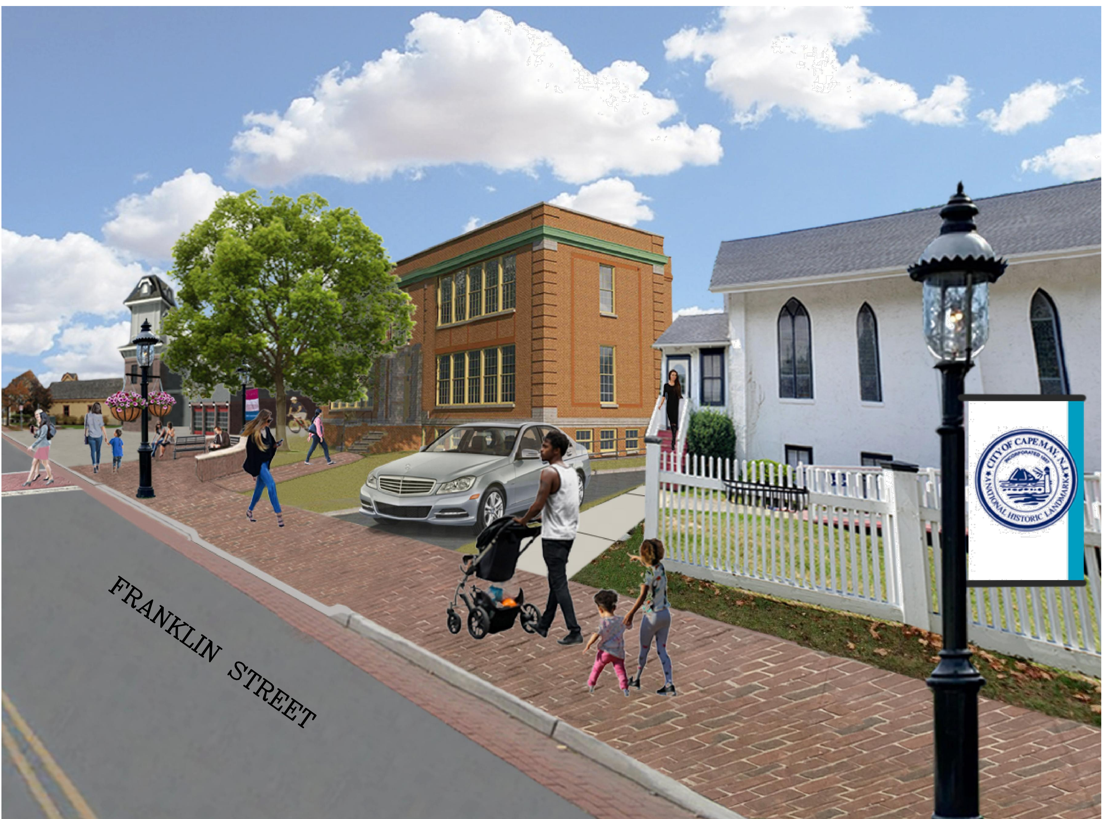
FRANKLIN STREET PERSPECTIVE