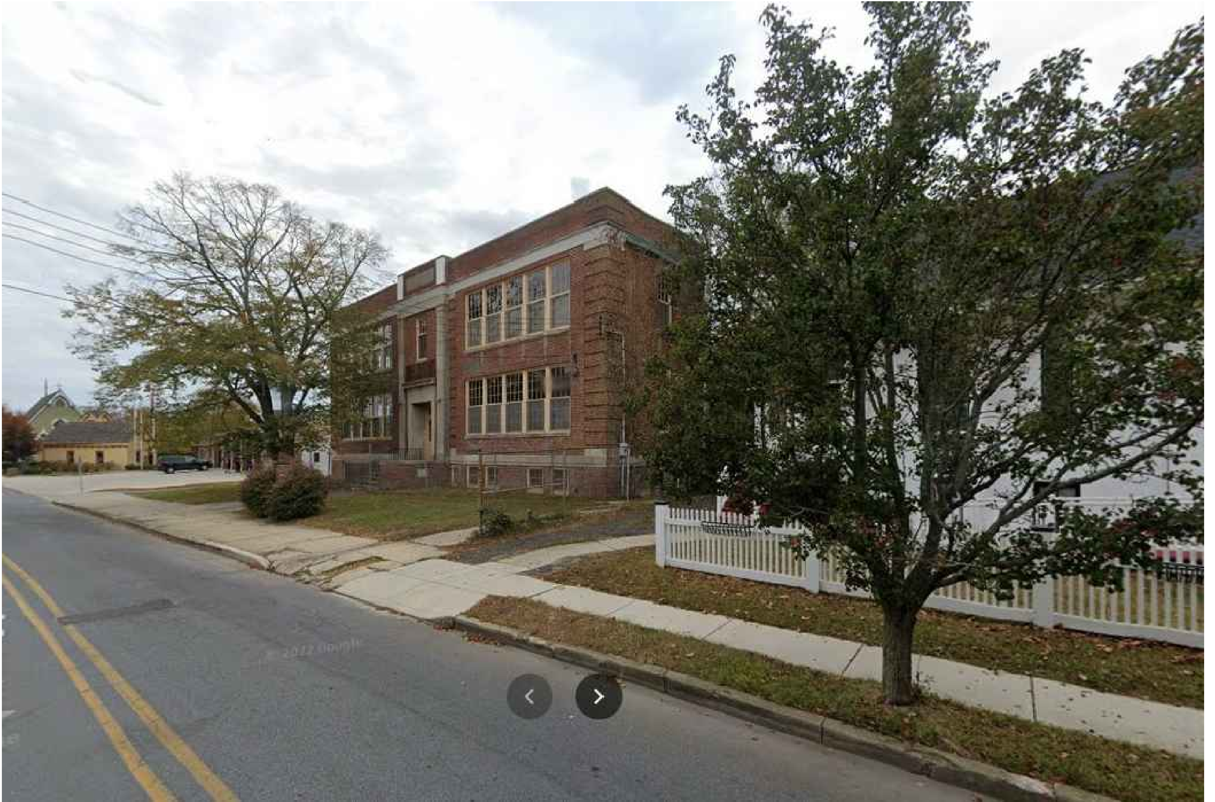
EXISTING FRANKLIN STREET VIEW (SOUTHEAST)