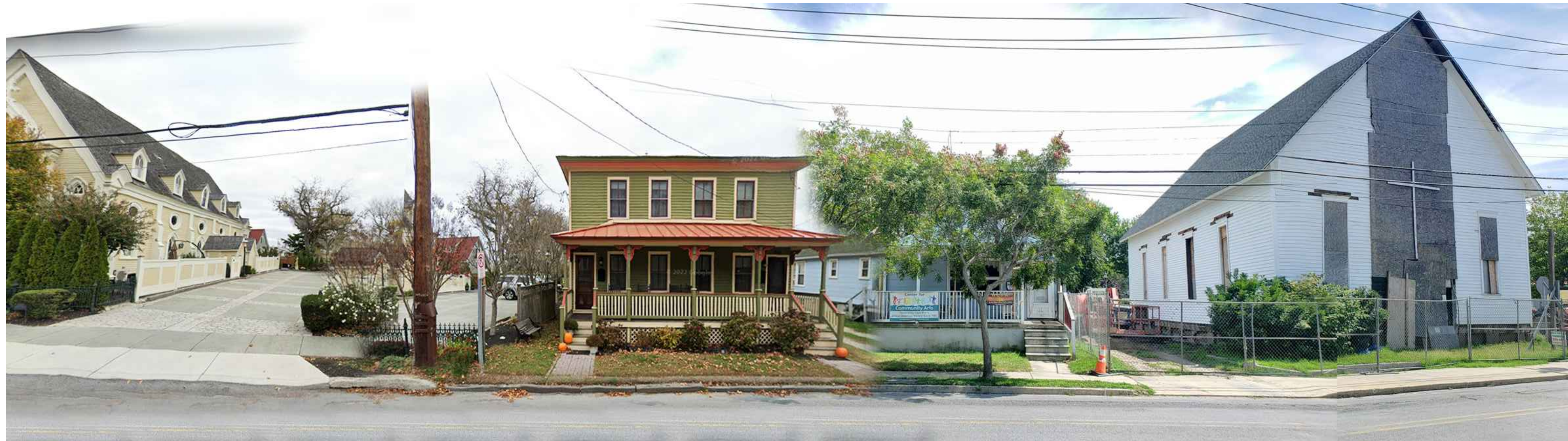
EXISTING FRANKLIN STREET VIEW (NORTH)